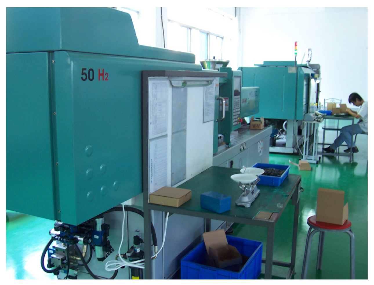
Page 3 of 3 China Array Plastics Molds Nuclear Medical Imaging Manifolds

PHOTO: Medical Injection Molding Cells at China Array Wuhan, Wuhan, China